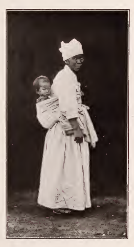
CARRYING THE BABY.

As in Italy all the roads lead to Rome. so in Korea Molds everything Public leads to Thought Seoul, and everybody longs to go to Seoul. As the Emperor and his cabinet reside here, Seoul naturally does the thinking for the whole people. What Seoul does what Seoul